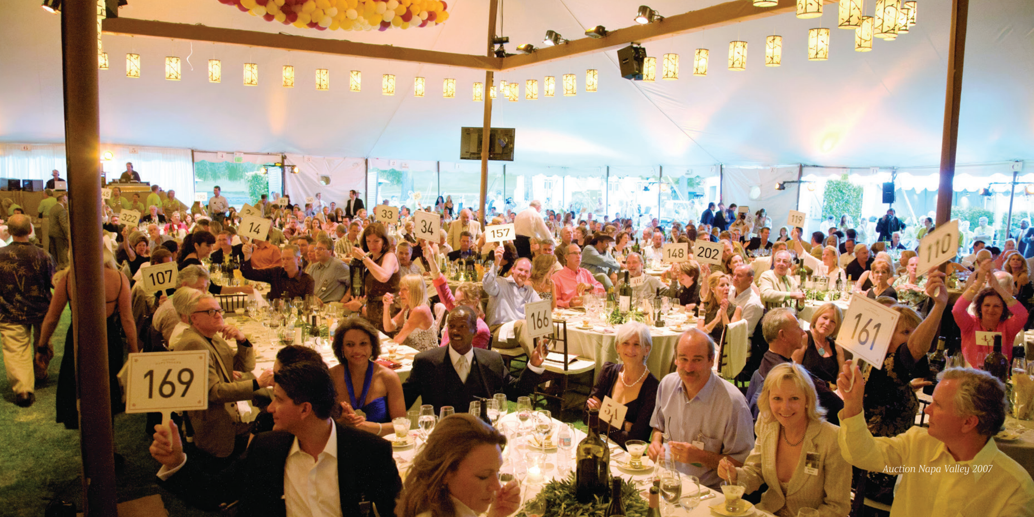
Auction Napa Valley 2007